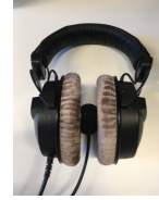
(b) Recording site 2