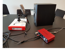
(a) Recording site 1

The volunteers, recruited from the ongoing EU H2020 OCTAVE project, were instructed to use their favorite recording/replay audio software in their smart-phones or other devices. To keep the re-recording time feasible, volunteers were provided with long audio files merged from the original utterances to make replay recordings a one-shot task. The long audio files would then be segmented automatically using embedded segment identifiers to obtain the individual utterances.